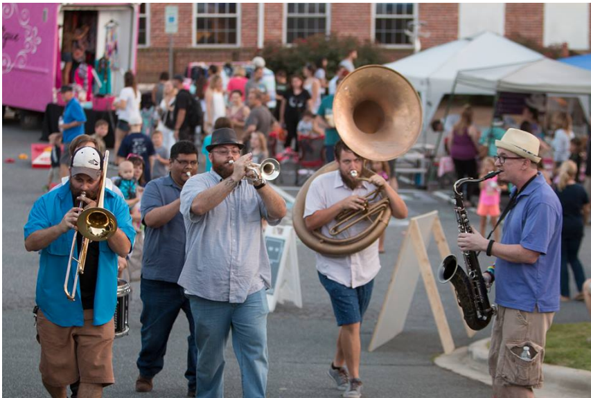
The People's Brass Band performs at a 2nd Friday Street Festival hosted by Bella Love Inc at Oak St Mill