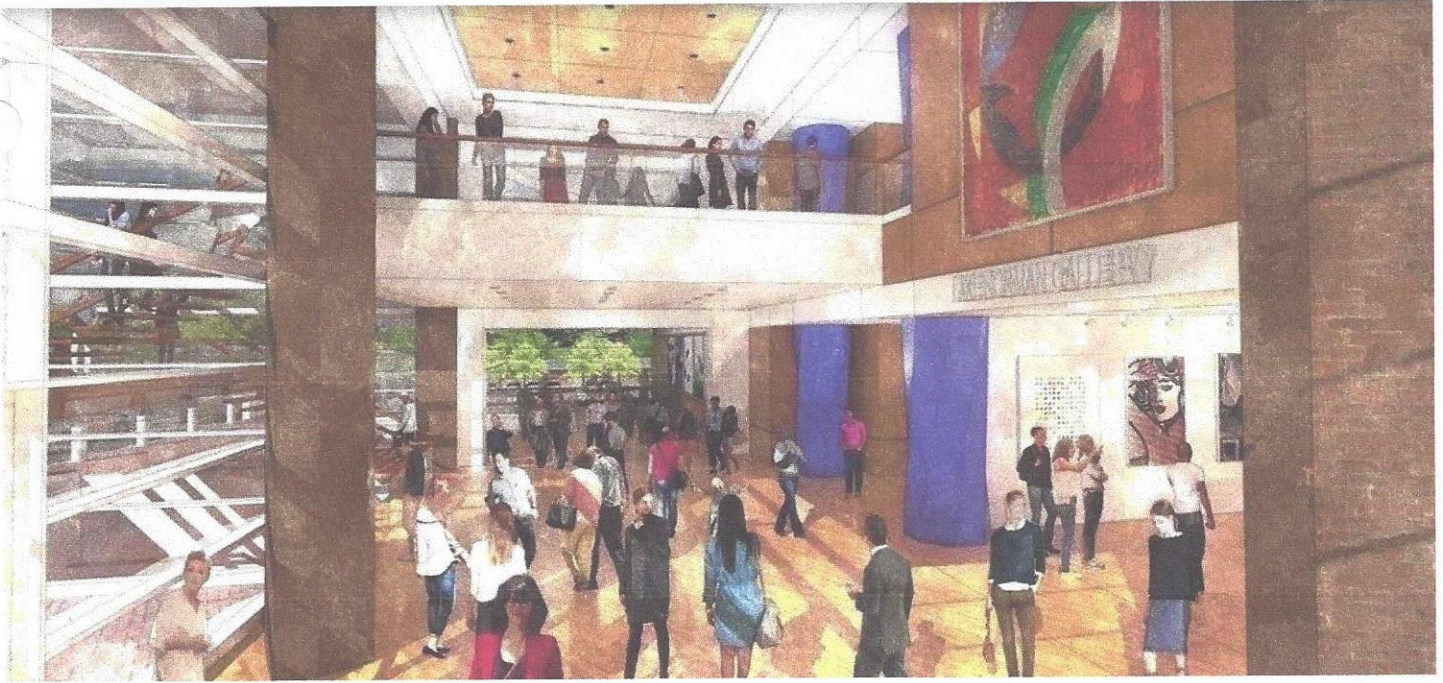
Another interior drawing shows the planned gallery.