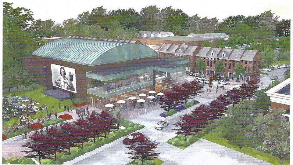
Conceptual rendering of Cain Center for the Arts as of July 2019