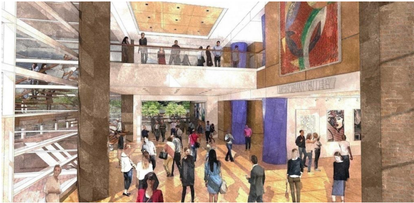
Rendering of the view from indoors of the future Cain Center for the Arts