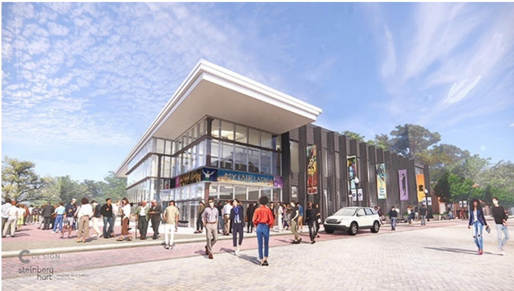
Another northeastern view.