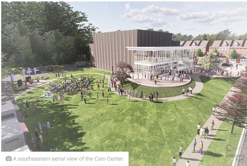
A southeastern aerial view of the Cain Center.

Ryan Pitkin • May 19, 2020 2 minutes read