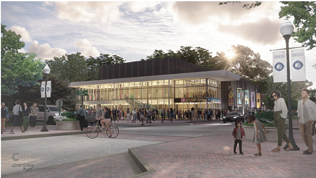
The northeast exterior at dusk.