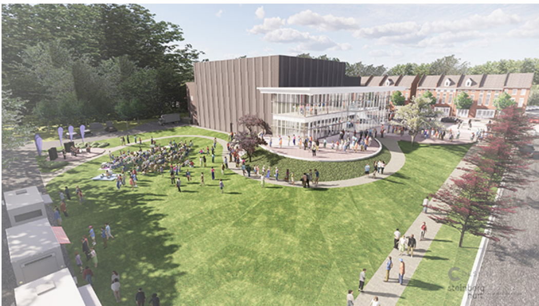
The southeastern aerial view.