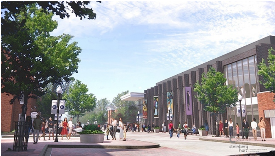
The western exterior of the Cain Center.

the past 10-15 years of a lot of growth and development. There's nothing against Uptown and Charlotte, we love Uptown, too, but to get to have this up here will be a great asset for the people who live here, and something for them to be proud of, too."