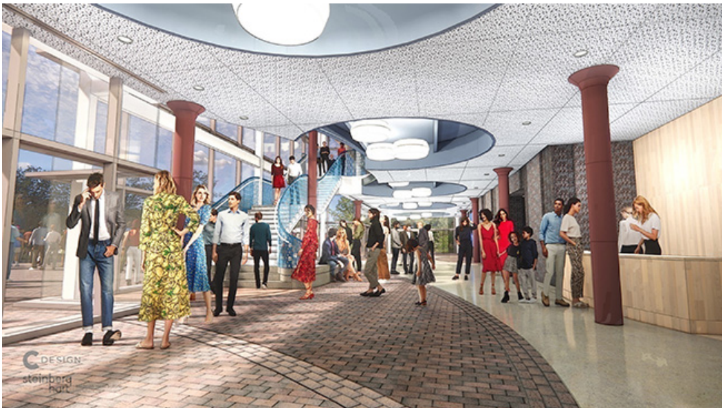
The lobby of the Cain Center.