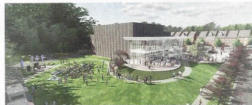
An artist’s rendering of Cain Center for the Arts, scheduled to open December 2022.

Programming at the center will be divided in three ways: performances, exhibits, and master classes by national and internationally known artists and performers; contracts with city and local performance groups—think Charlotte Ballet or Davidson Community Players; and opportunities for the community to rent out space